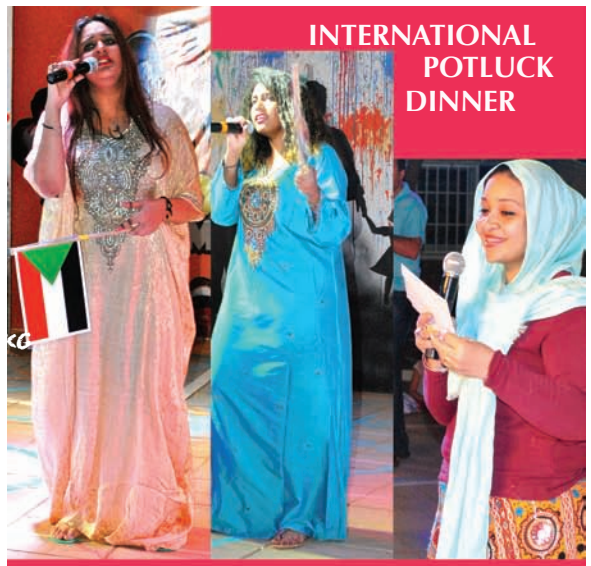
INTERNATIONAL POTLUCK DINNER

With one week to go in the semester, the children and teachers are working hard to finish with success. We thank you for your continued support during the final days of the semester. I wish you a pleasant afternoon and evening. And I look forward to seeing you in the future at the Thursday open-house meet and greet coffees.